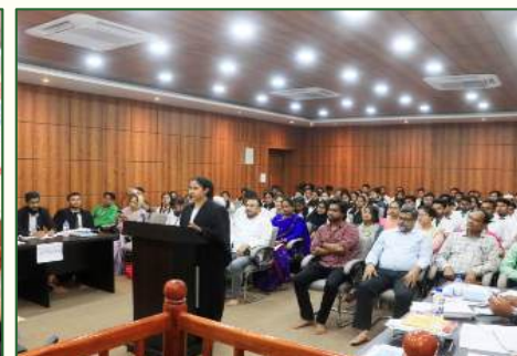
INTRA COLLEGE MOOT COURT COMPETITION