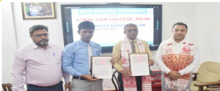
MOU SIGNING WITH GUJARAT UNIVERSITY