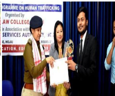
OBSERVATION OF NATIONAL DAY OF SOCIAL JUSTICE