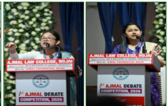
1ST AJMAL DEBATE COMPETITION, 2026