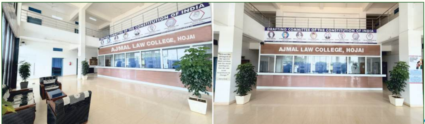
AJMAL LAW COLLEGE, NEW CAMPUS

Ajmal Law College believes in the all-round development of students. Alongside academic activities, students are encouraged to participate in debates, seminars, community service, and co-curricular clubs that help shape confident and socially aware individuals.