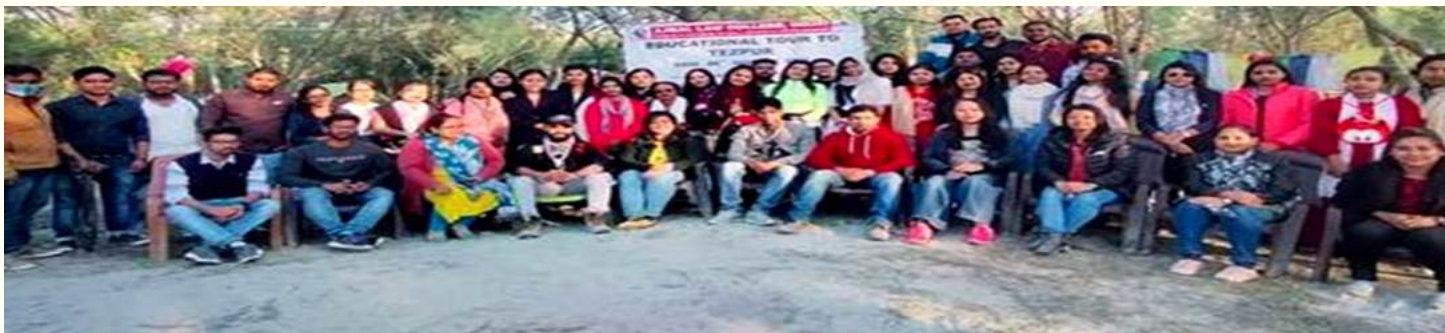
EDUCATIONAL TOUR OF AJMAL LAW COLLEGE