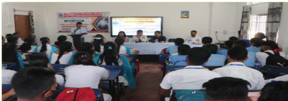
CAREER COUNSELLING PREGAME, LEGAL STUDIES