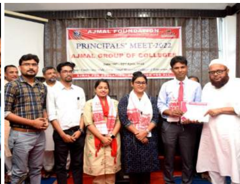
RECEIVING BEST TEAM-BUILDING AWARD FROM HON'BLE MANAGING TRUSTEE, AJMAL FOUNDATION