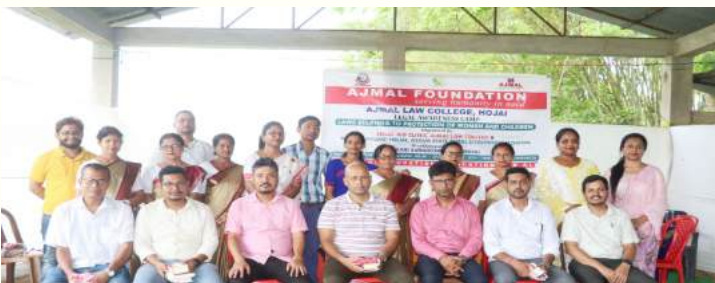
LEGAL AWARENESS CAMP