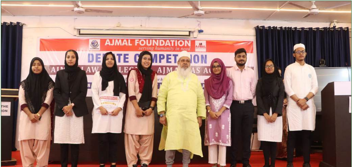
INTER & INTRA COLLEGE DEBATE COMPETITION