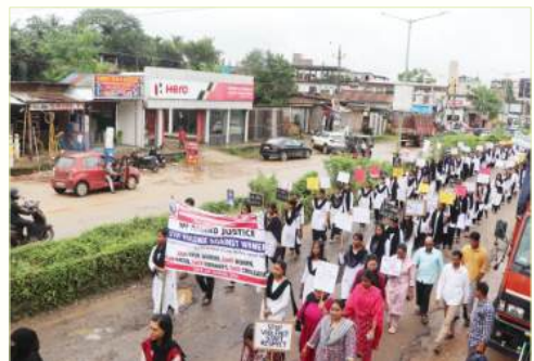
SILENT PROTEST ON THE INCIDENT OF KOLKATA RAPE CASE-2024