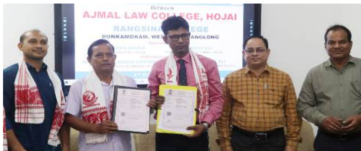
MOU SIGNING WITH RANGSINA COLLEGE